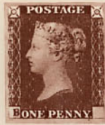
GREAT BRITAIN 1841