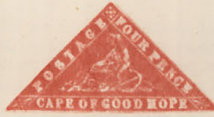
CAPE OF GOOD HOPE 1861