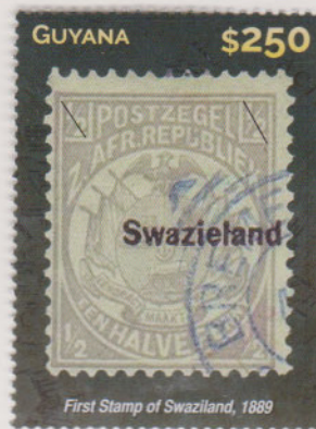
First Stamp of Swaziland, 1889

SOS-2015-Guyana Y&T n° First Stamps of UNO States