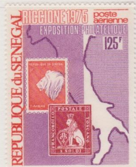
1966-Senegal n° TX37 (I) € 0,15 SOS-1975-Senegal Y&T n°A147 Riccione Expo