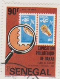
1979-Senegal n° 515 € 4,45 SOS-1982-Senegal Y&T n°589 Dakar '83