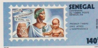
1961-Senegal n° 204 € 1,00 SOS-1987-Senegal Y&T n° 700 ND 100° Senegal Stamps