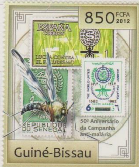
1962-Senegal n° 214 (III) € 1,00 SOS-2012-Guinea Bissau Y&T n° Anti-Malaria Campaign