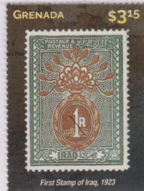
First Stamp of Iraq, 1923

1923-Iraq n° 57 € 5,00 SOS-2015-Grenada Y&T n° First Stamps of UNO States