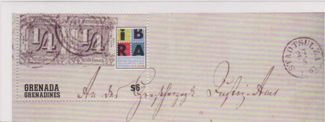
1851-Thurn & Taxis North n° 1 - € 200,00 SOS-1999-Grenada Grenadines - Y&T n°B436 IBRA '99